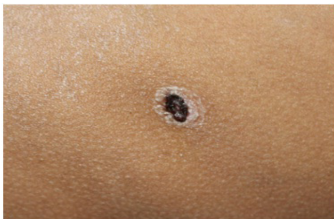
[Table/Fig-1]: Eschar (Left infra axillary region).